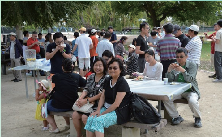
Previous summer picnics